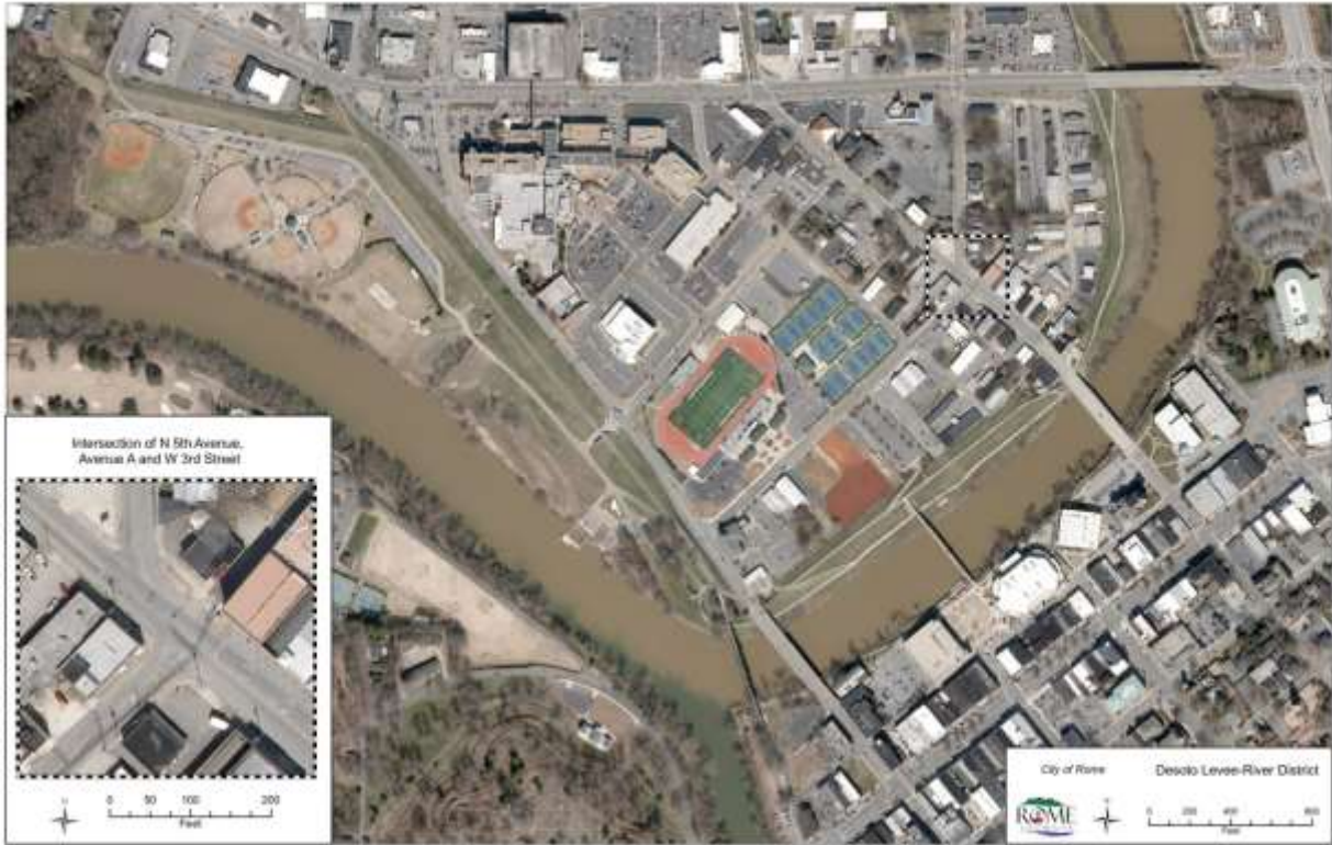
Intersection of N 5th Avenue, Avenue A and W 3rd Street

City of Rome Desoto Levee-River District